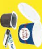
Jars and tubes