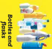
Bottles and flasks