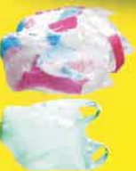
Plastic bags and films